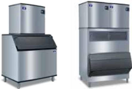
IDF2100C Ice Machine on a D-970 Bin