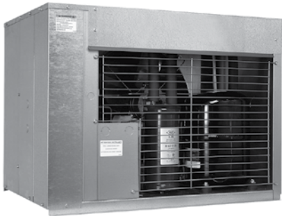
CVDF2100 Condensing Unit