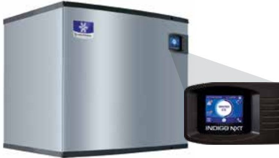
IDF2100C Ice Cube Machine - 115V